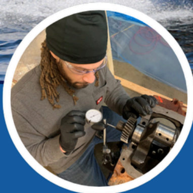
Marine Systems & Boatyard Management